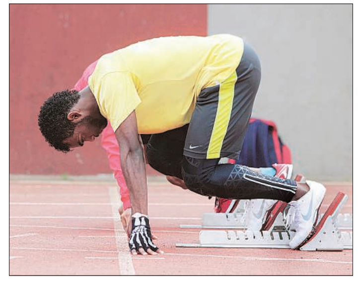
(Clockwise from left) Almost 600 athletes had flown in from different countries to participate in the games; the risk of sports injuries is high in events such as shot put, discus throw and track running; around 400 patients were checked and treated at the makeshift hospital

emergency medical services. Chandanwale said six medical